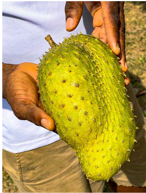
Soursop Fruit – medicinal compound - grown in Ahoto

We strive to achieve international standards in the services we provide to our clients. We focus on helping them to be the best they can be, and we strongly