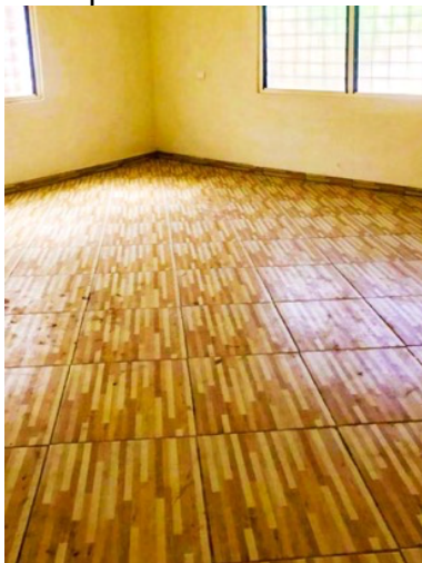
Quads House – Bedroom