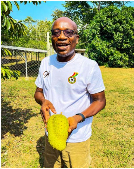
Greetings from Ahoto

We strive to achieve international standards in the services we provide to our clients. We focus on helping them to be the best they can be, and we strongly