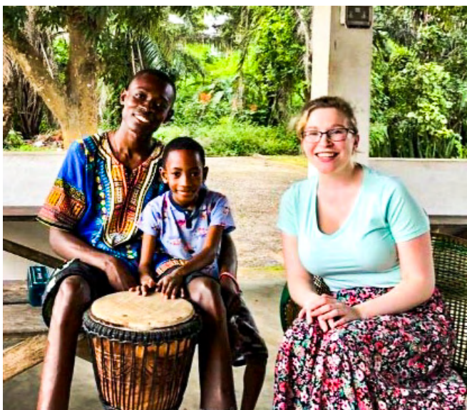
Music Therapy in St. Clare's

For other donations, please use the IFoA account (see details below). IFoA is a registered charity with 'Tax Exemption Status,' which means your donations go even further.