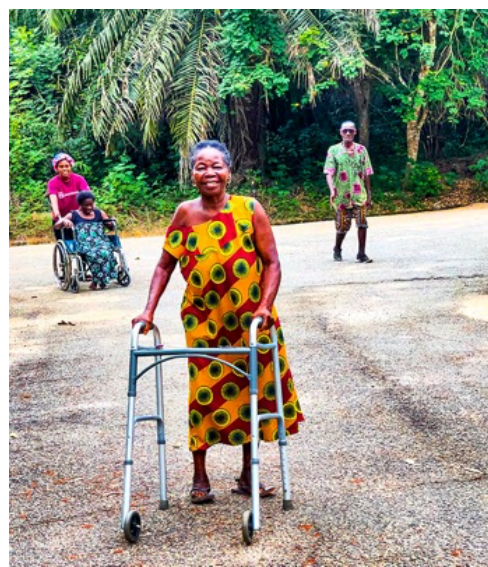
St. Clare's residents enjoying exercise

The intern students were very successful in engaging the young people in the village. Three times weekly, they helped them with their homework and taught them other subjects.