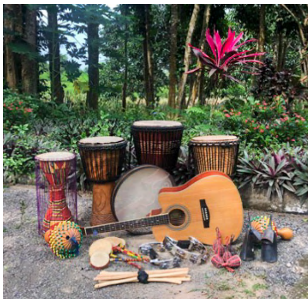
Musical Instruments Donation

We continue to search for new funding sources to avoid over-reliance on our existing generous donors. There are always more deserving cases than there are funds available. If you'd like to donate in the UK, please use this link: https://www.ahoto.org/support .