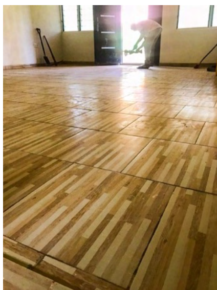
Quad's House – Reception Area