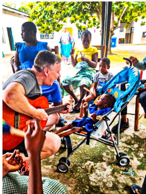
Music Therapy in St. Elizabeth's

Our funding is dwindling, but we hope the new members will have ideas to inspire increased contributions. Donations are still received regularly, but it would be good to have more in the bank for future needs.