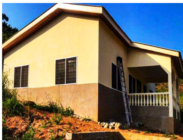
Quad's House - newly painted