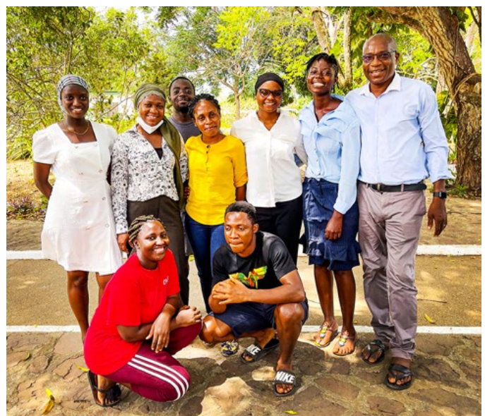
Winneba University Intern Students

St Joseph's has transitioned to providing outreach services only, which means that the residential aspect of our service has now ceased. Our outreach service focuses on community-based support for disadvantaged/vulnerable children and their families. Our goal is to achieve the best possible outcome for each client within our financial and workforce constraints.