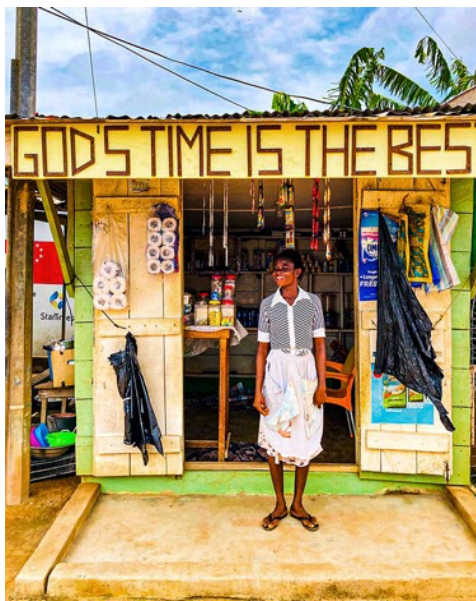
Gloria's shop and new sign